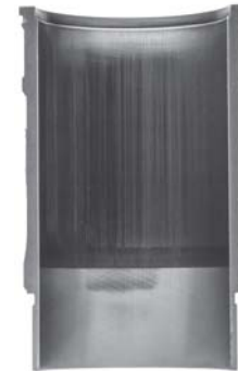
Severely Scuffed Liner