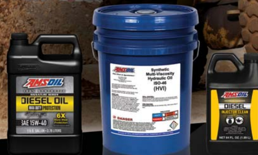
SYNTHETIC DIESEL OIL