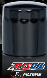
AMSOIL E3 FILTERS