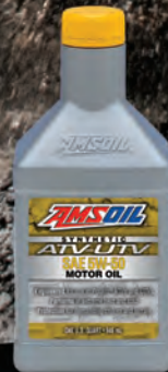
SYNTHETIC MOTOR OIL