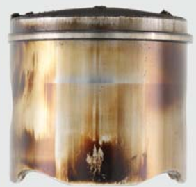
ECHO Power Blend @ 50:1